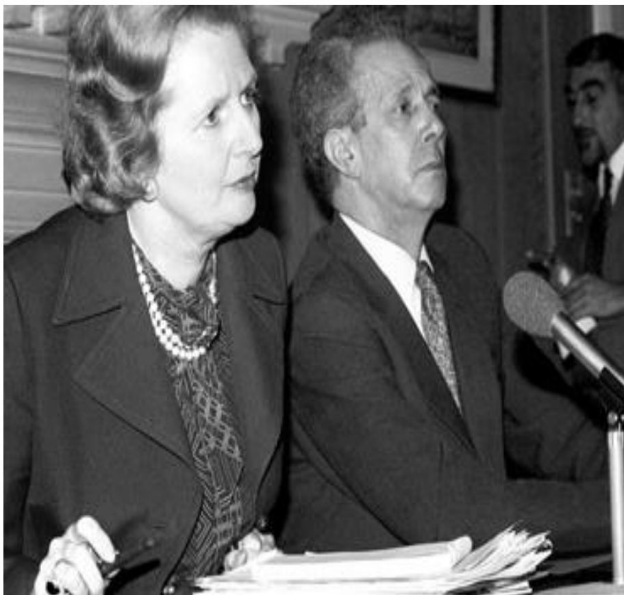
Keith Joseph & Margaret Thatcher