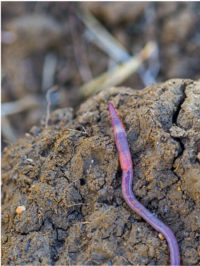
Cherck Sarrour @ InRA_Agrif