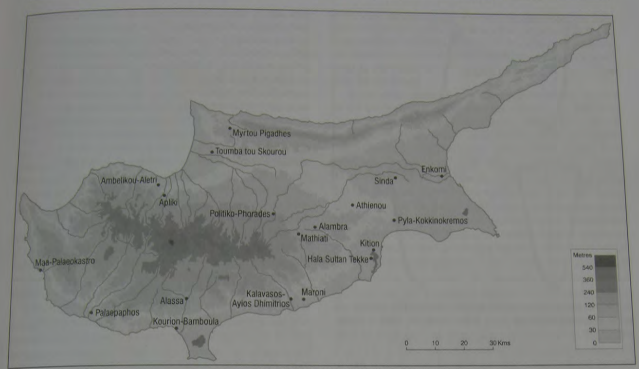
Fig. 4.2: Cypriot LBA sites

probably among the earliest in Cyprus (Karageorghis and Demas 1988, I, 261). One of the features of the Mycenaean IIIC:1 repertoire at Maa is a large number of skyphoi (drinking cups). Such vessels are also known at Palaepaphos but not in the eastern Cypriot sites, and comparanda also exist at Tarsus in Cilicia (Karageorghis and Demas 1988, I, 326). The presence of locally made versions of these wares at Maa surely suggests that individuals who were, at the very least, highly influenced by Aegean cultural preferences, manufactured them there. Taken together with the other archaeological evidence, including cooking jugs and loom weights, the balance of probability must be in favour of some Aegeans living at this short-lived settlement.