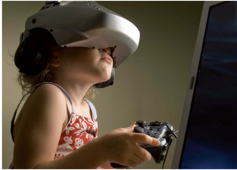
Figure 1. Child playing a virtual reality game with a head-mounted display.