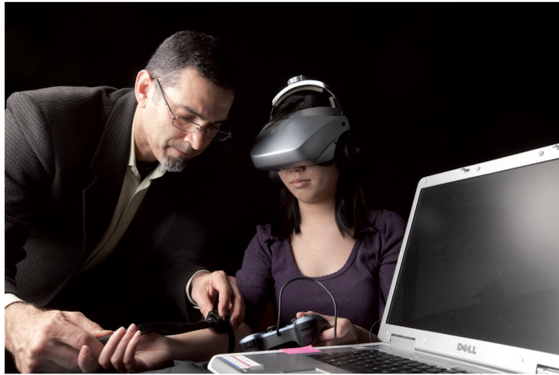
Figure 3. Investigator attaches the Medoc 30 × 30 mm ATS thermal stimulator probe to administer a noxious stimulus.