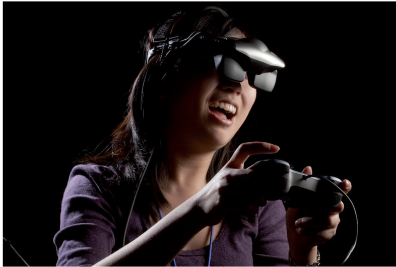
Figure 2. Participant enjoying a virtual reality game.